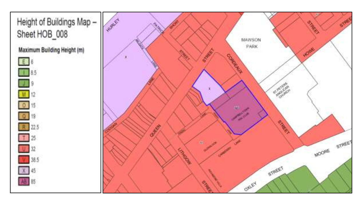
Figure 6: Proposed CLEP 2015 Height of Building Map. The proposed height of building for the subject site would incorporate a 45m permissible building height for 158 Queen Street, Campbelltown and 85m for the remainder of the site which includes 1 Carberry Lane and 3 and 11 Cordeaux Street, Campbelltown.