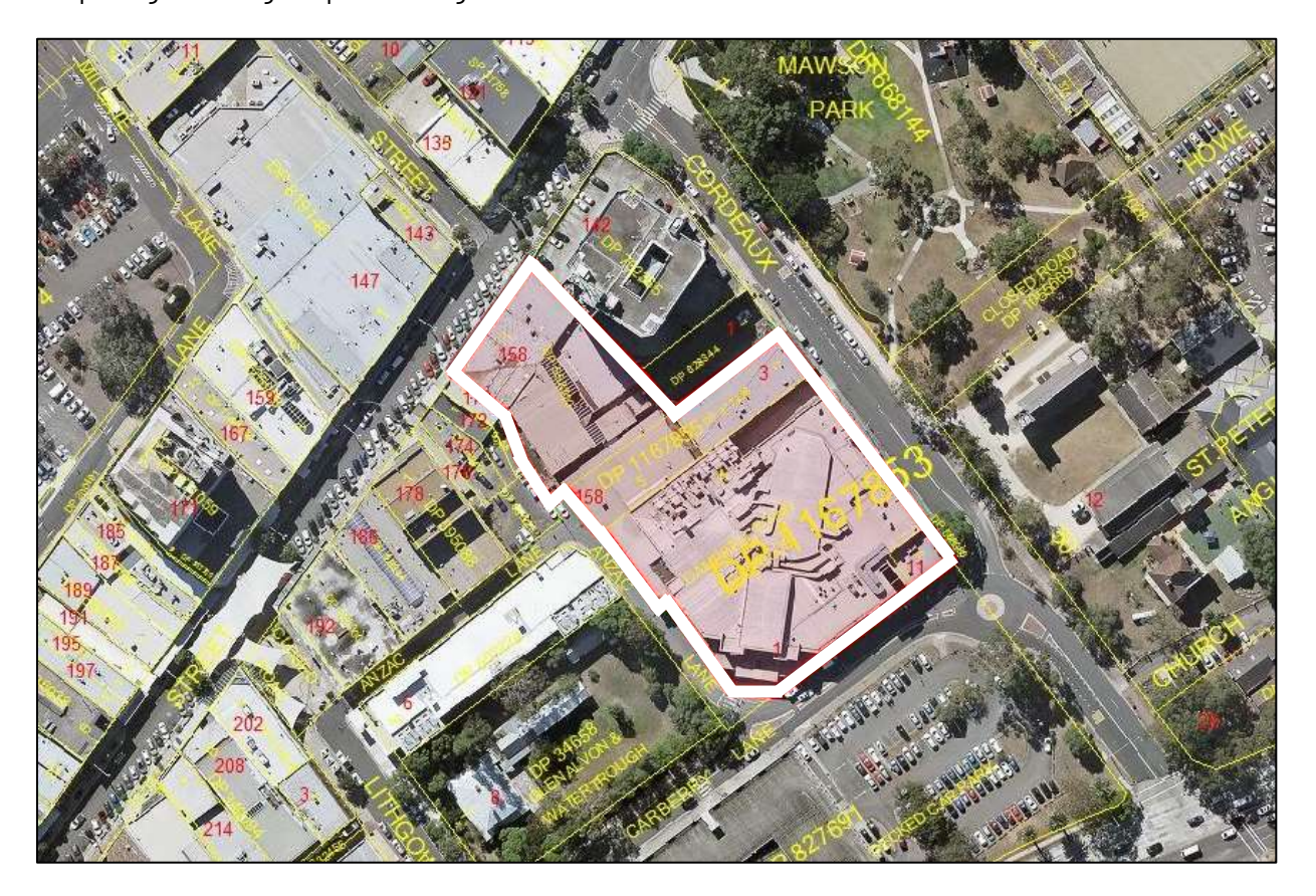
Figure 1: Location Map - Subject site and its immediate locality

The Planning Proposal has been prepared in accordance with the Environmental Planning and Assessment Act 1979 (EP&A Act) and the Department of Planning and Environment's 'A Guide to Preparing Planning Proposals' August 2016.