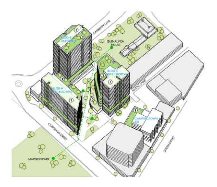
Figure 2: Design Concept