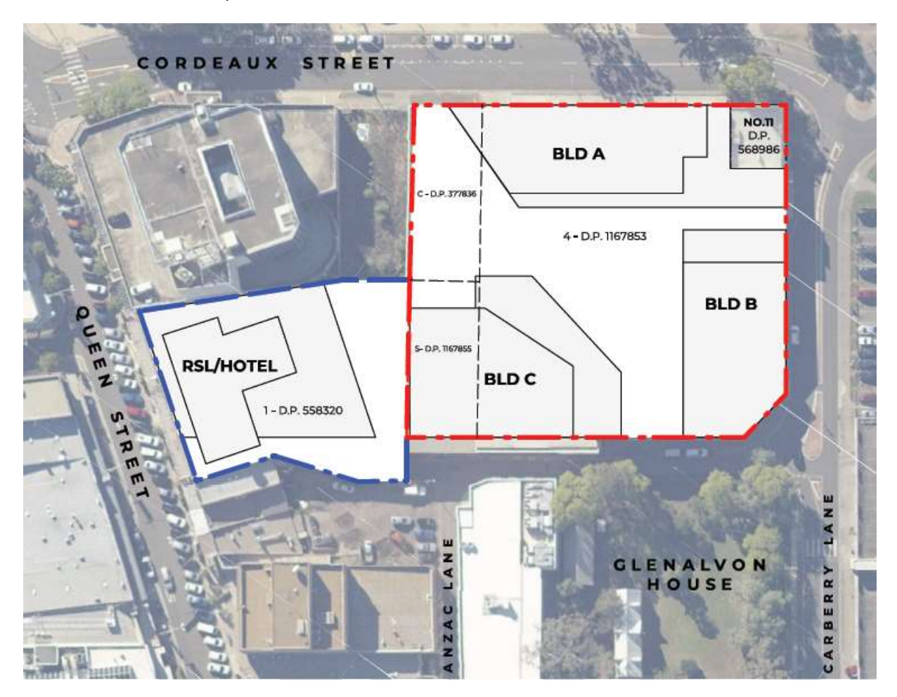
Figure 3 – Distribution of the RSL/Hotel site within the blue border and the mixed use site within the red border.

The minimum FSR relating to the employment floor space will be included as a site specific clause under Part 7 of the CLEP 2015.